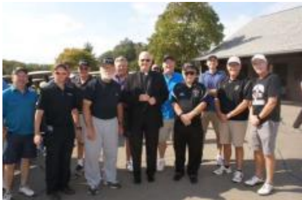
Bishop David High School Alumni Join Together to Support Catholic Education with a Golf Scramble